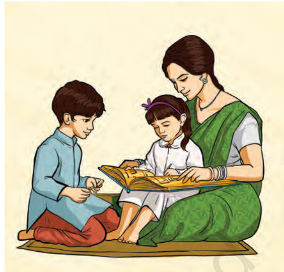
Examples of nuclear families

brothers, sisters and cousins. A nuclear family, on the other hand, is limited to a couple and their children, and sometimes one parent and children.