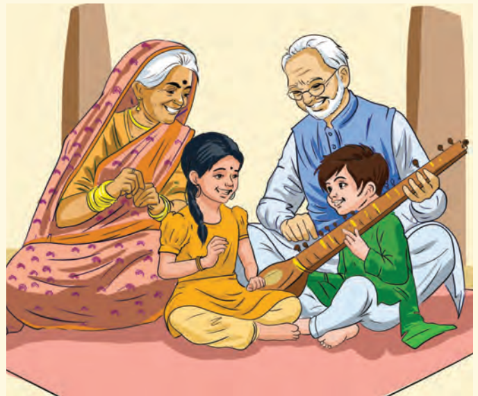
Examples of joint families