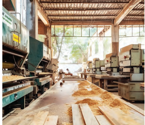
Furniture production unit