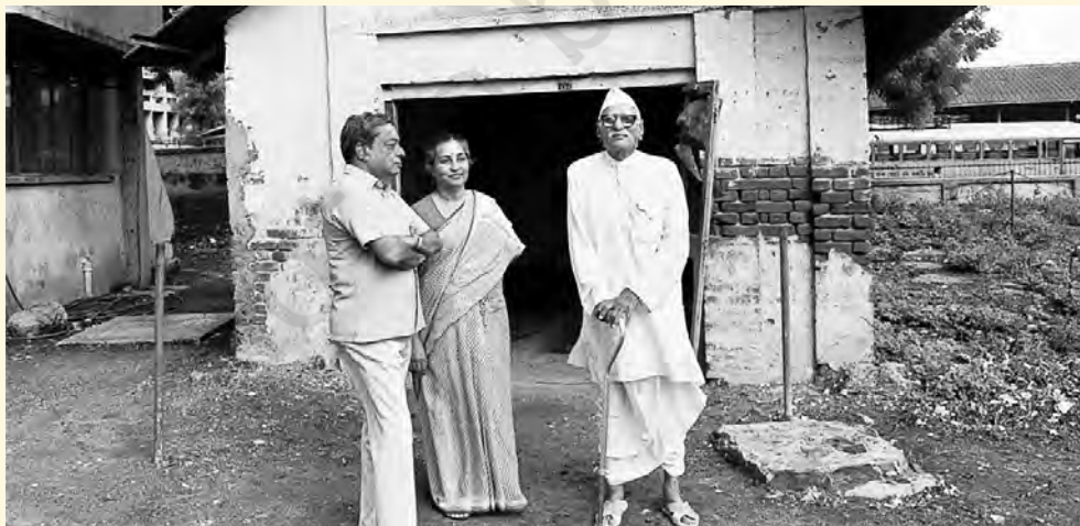
Varghese Kurien (left) and Tribhuvandas Patel (right)

Amul was set up in 1946 under the leadership of Tribhuvandas Patel (lawyer and freedom fighter) and Dr. Varghese Kurien (an engineer who was working at a dairy factory in Mumbai).