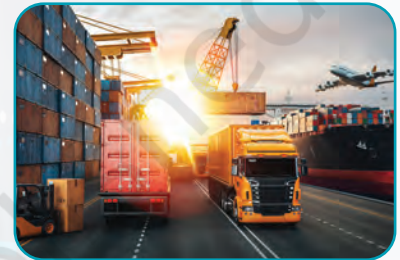
Trade and logistics