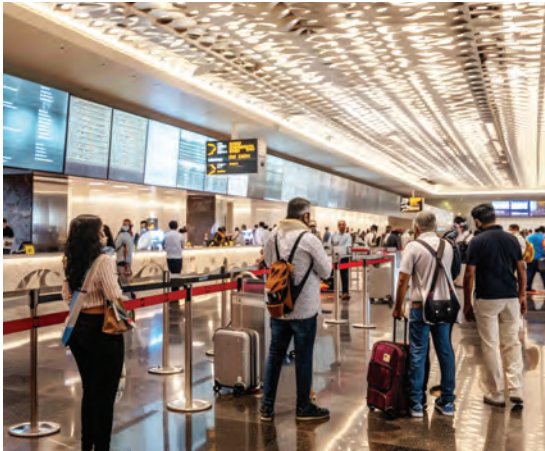
Services at airports