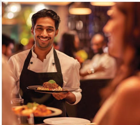
Services at restaurant