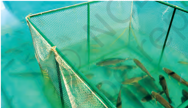
Fish farming (fishery)