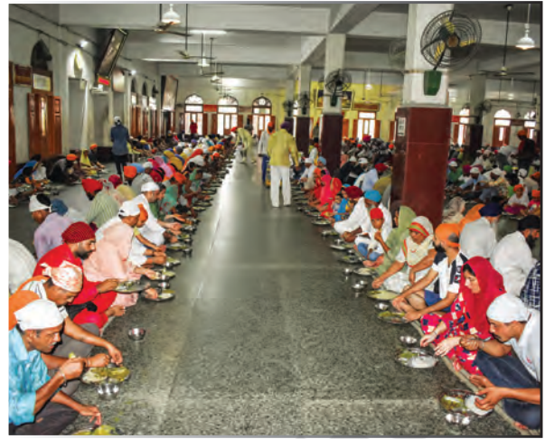
Langar at the Golden Temple