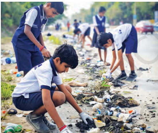
Swachh Bharat Abhiyan