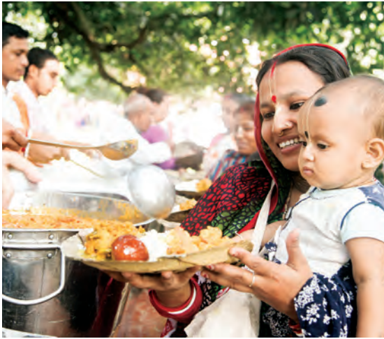
Temple distributing prasād to devotees

for what we have, and they are also a way of contributing to society without expecting anything in return.