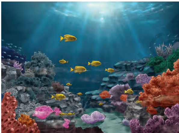
An underwater view of an Ocean

vastness of outer space, from what is cooking in the kitchen to what is happening on the playground, some of the most groundbreaking discoveries have often come from unexpected places.