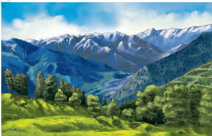
A mountainous region