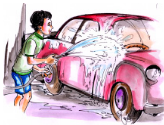
shining a car