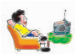
watched the radio

2. See the pictures carefully and write the lines from the poem under the related picture.