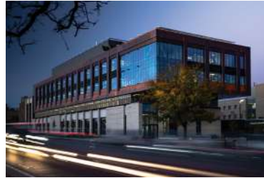
Amit Chakma Engineering Building, one of many campus buildings that features collaborative learning, teaching and study areas

Western is located in London, Ontario, Canada, a city renowned for excellence in education and health care, its lively arts, culture and sports scenes, as well as many recreational opportunities.