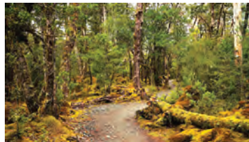
(b) lost in a forest