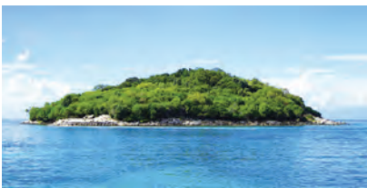
(a) marooned on an island