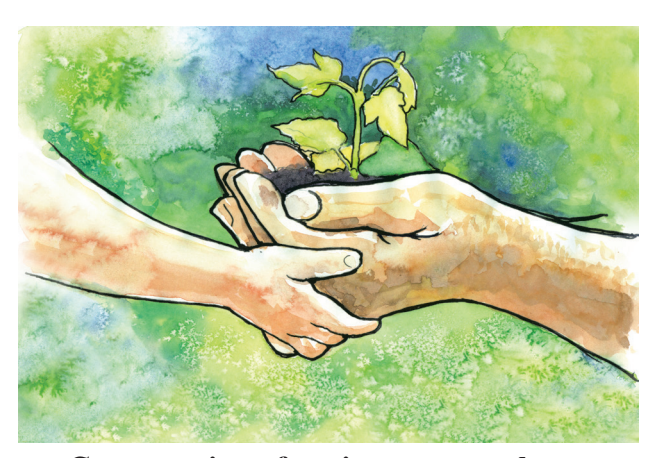
Conservation of environment: a legacy

The visible effects of the decline of environment are extinction of species of plants and animals, decrease in the fertility of soil, water shortage, fluctuation in the proportion of rainfall, global warming, drying up of rivers and lakes, pollution of rivers and seas, incidence of newer diseases, acid rain, thinning of the ozone layer, etc. Even if some of the effects are restricted to particular nations, these problems reach global proportions,