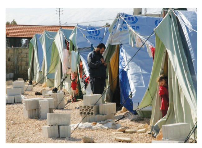
United Nation's aid to refugees

Before the Second World War, the Jews were tortured in Germany. Their citizenship and property was confiscated. Due to this, the Jews became refugees. In 1971, the people in East Pakistan turned refugees and came to India seeking refuge due to political and religious persecution. In the last few years due to the war-like