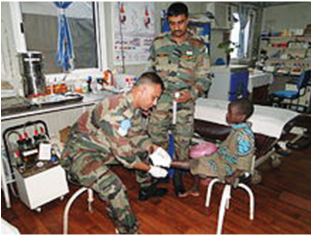
Indian Peacekeeping Forces

United Nations Peacekeeping : The peacekeeping activity of the United Nations involves creating appropriate circumstances favourable for bringing about permanent peace in strife-torn areas. The peacekeeping forces help these areas to progress towards peace. In conflict-ridden areas, security is provided and at the same time, help is extended for