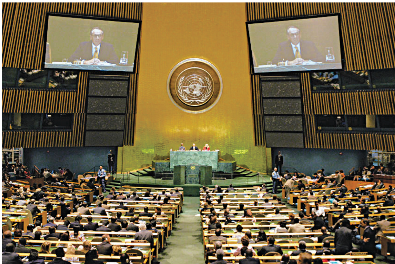
United Nations-General Assembly