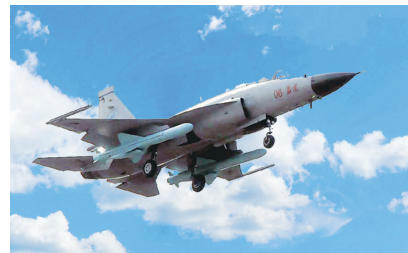
The Air Force