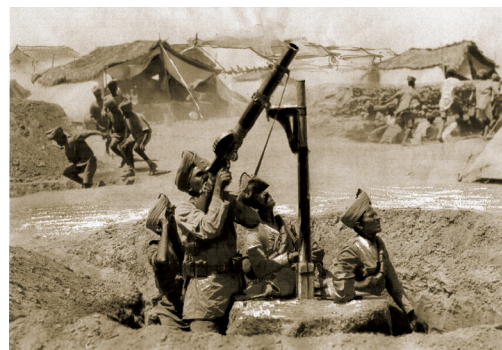
Indian Soldiers on a battlefield in the First World War

League of Nations was established after the First World War to establish peace. But it did not succeed at preventing war. Autocratic regimes came up in Germany, Italy, Spain and other countries. All these developments culminated in the Second World War.