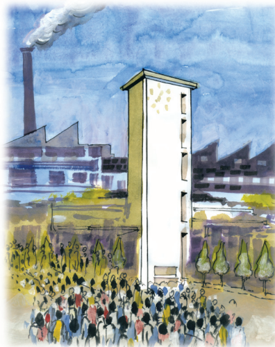
Bhilai Steel Plant

This plan had ambitious goals of industrialisation. Iron and steel industries at Durgapur, Bhilai and Rourkela; Chemical fertilisers plant at Sindri; rail engine factory at Chittaranjan; factory of railway bogies at Perambur; Ship building factory at Vishakhapatnam and other heavy industries were set up in the Public Sector. Huge dams like Bhakra- Nangal, Damodar, etc. were built to make water available for agriculture. It led to increase in the national income.