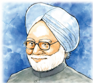
Dr Manmohan Singh

P. V. Narasimha Rao appointed Dr Manmohan Singh as Finance Minister in order to find a way out of this situation.