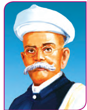
Dr. R. G. Bhandarkar

Indian scholars like Dr. Bhau Daji Lad, Dr. R. G. Bhandarkar made intensive study of ancient Indian culture. After understanding that we are blessed with glorious ancient tradition, the Indians were awakened with a sense of Identity. The 'Bhandarkar Oriental Research Institute' is working since last 100 years in Pune.