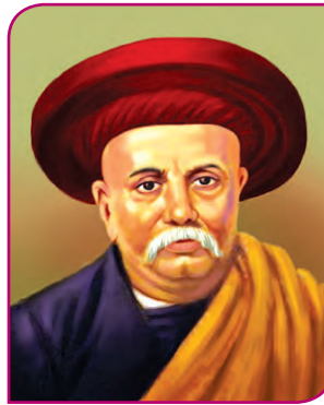
Dr. Bhau Daji Lad

The 'Asiatic Society' was established at Kolkata by the British. Many Indian and western scholars started study of Indian culture. The manuscripts in Sanskrit, Persian and other languages were examined and research was published.