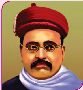
Gopal Krishna Gokhale

Gopal Krishna Gokhale founded the 'Servants of India Society' in 1905. To create love for the country, teach them sacrifice of self interest, differences between religion and caste should be destroyed and to create social harmony, spread of education were the main objectives of the servants of India society.