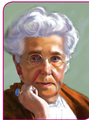
Dr. Annie Besant

1916, under the leadership of Lokmanya Tilak, an attempt was made to resolve the dispute in the Indian National Congress. In the same year there was an agreement between Indian National Congress and Muslim League known as the 'Lucknow Pact'. According to this pact, the Indian National Congress agreed to separate electorates to Muslims and Muslim League agreed to support the Indian National Congress in its work for getting political rights to India.