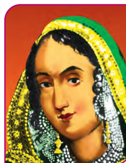
Begum Hazrat Mahal