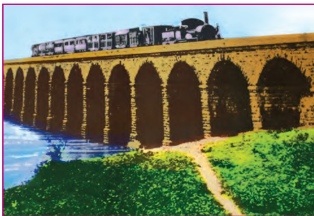
Mumbai-Thane Railway (1853)

Development in transport and communication system : For increase in trade and convenience of administration, the British developed modern facilities like transport and communication in India. In 1853, first Railway ran on the route of Mumbai to Thane. In the same year British started Telegraph system in India. Due to it all cities and military stations got connected to one another. Similarly the British also started the Postal System.