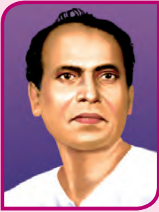
Lokshahir Annabhau Sathe