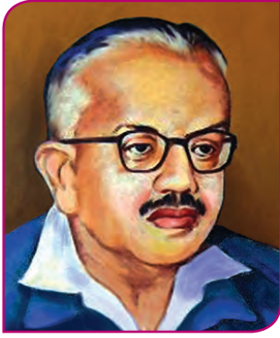
Dr. T. B. Cunha

Committee. Later in 1945, Dr. Cunha founded the organisation 'Goa Youth League' in Mumbai. In 1946, he went to Goa and violated the ban on public speech. For this he was sentenced to eight years of imprisonment. In 1946, Dr. Ram Manohar Lohiya started a Satyagraha for liberation of Goa. Violating the ban, he delivered a public speech at Madgaon in Goa. For this the Portuguese Government deported him.