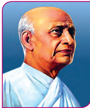
Sardar Vallabhbhai Patel

Sardar Patel convinced the princely rulers the benefit of merging into India.