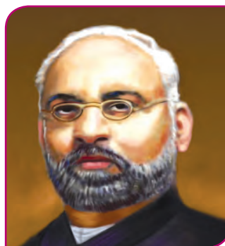
Pt. Shyamji Krishna Varma

India House : The revolutionary work in India received assistance from Indian revolutionaries staying abroad. India House, in London, was an important centre which provided for such kind of assistance. Pandit Shyamji Krishna Varma, an Indian patriot, had established