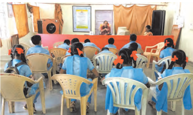
Figure 10.1: Visit to the election office

Prepare a plan for a fieldtrip of your class to a place of special interest/visit to an office and prepare a questionnaire.