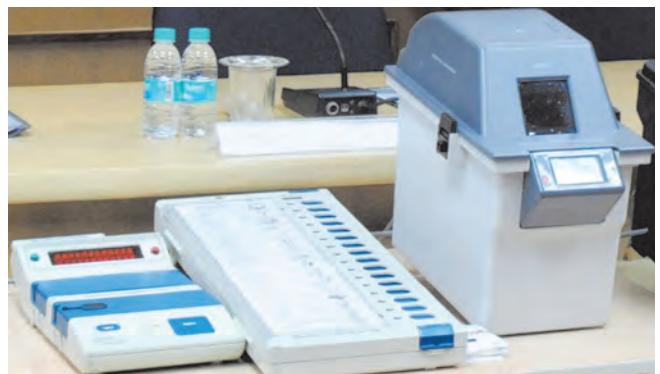
Figure 10.4: Electronic Voting Machine