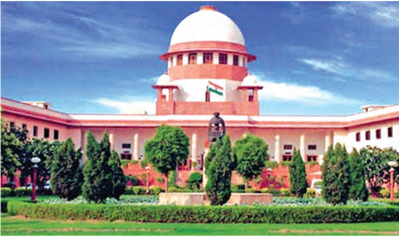
Supreme Court of India, Delhi