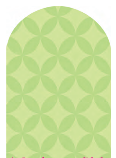
In what state did the important man in the city find the statue?

What do you think, was the part of statue which did not melt?