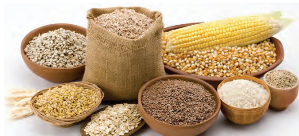
7.2 : Cereals

In living things, the process of taking in food and water and using it for growth and other purposes is called 'nutrition', and the constituents of food useful for these purposes are called 'nutrients'.