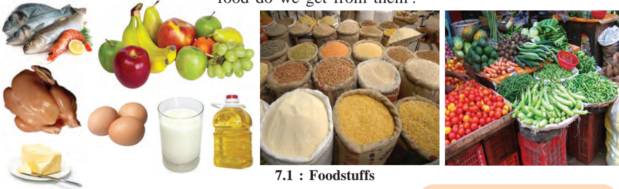
7.1 : Foodstuffs

Which are the various groups of foodstuffs? Name the ones you see in the pictures. Which main constituents of food do we get from them?