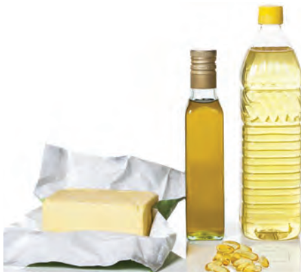
7.3 : Fatty foods