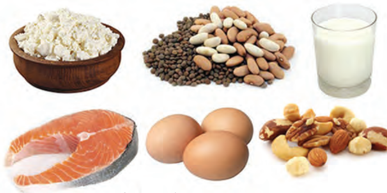
7.4 : Proteins

We need proteins for the purposes of growth, repairing the wear and tear of the body and for other life processes. We get proteins from the sprouts, milk and milk products, meat and eggs in our food.