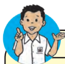
7.5 : Vitamins

Group activity : The information in the above chart should be enacted through role play.