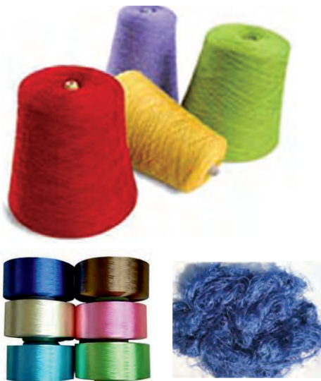
6.3 : Artificial threads