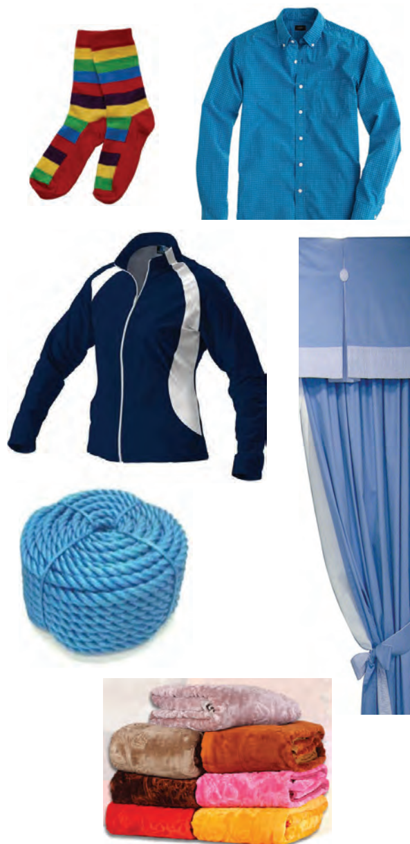
6.4 : Uses of artificial threads

These threads were invented at the same time in New York and London. Therefore the initials NY of New York and LON from London were combined to name them NYLON. Nylon threads have a shine and are strong, transparent and water resistant. They are used to manufacture clothes, fishing nets, ropes, etc.