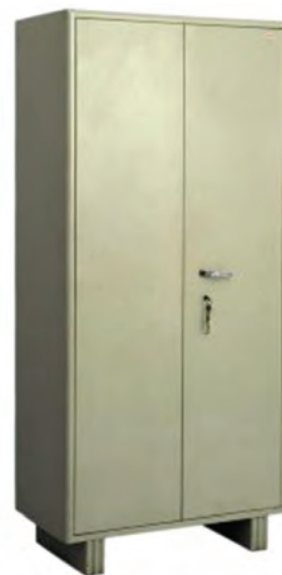
6.1 : Different objects