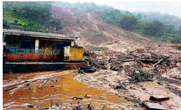
4.4 : The disaster at Malin village