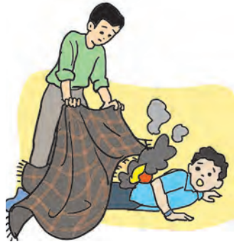
4.9 : Immediate steps for burns