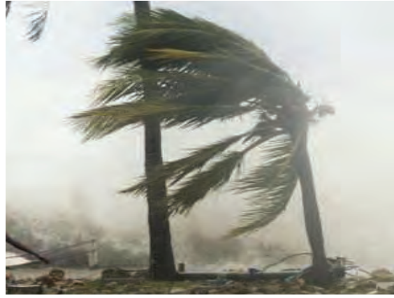
4.5 : A storm