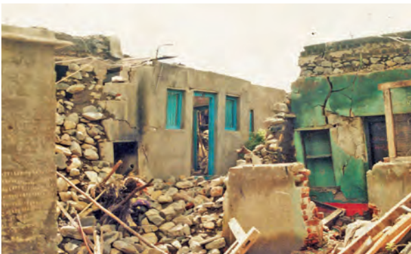
4.2 : Effects of the earthquake at Killari