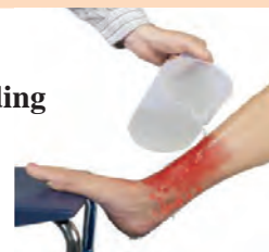
4.8 : Bleeding

If a person is bleeding, first make him sit or lie down comfortably. Keep the bleeding part of the body above the level of the heart and clean it with water.