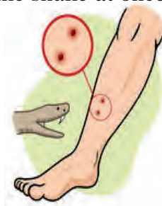
4.11 : First aid for snakebite