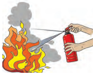
4.7 : Remedial and preventive measures