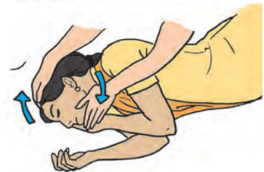
4.10 : First aid for sunstroke