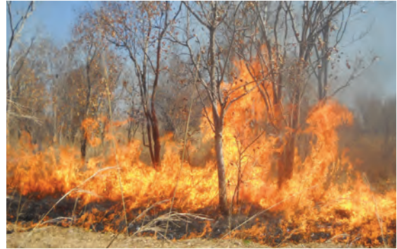
4.6 : A forest fire