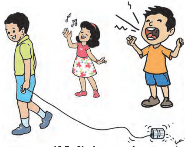
13.7 : Various sounds

A loud sound is harsh to the ear. Such sounds produce noise.