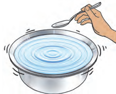
13.5 : Vibrations in the water and production of sound

Why are waves formed on the water in the pot?