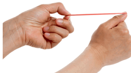
13.3 : A stretched rubber band

Apart from the movement of the rubber band, what else did you notice?