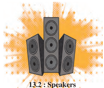
13.2 : Speakers

Put off the music. What do you feel now?