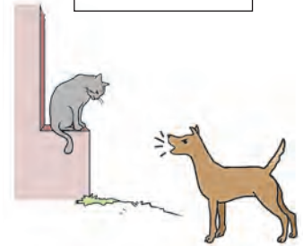
13.1 : Examples of various sounds

1. Which sounds do you hear during the recess in the school?