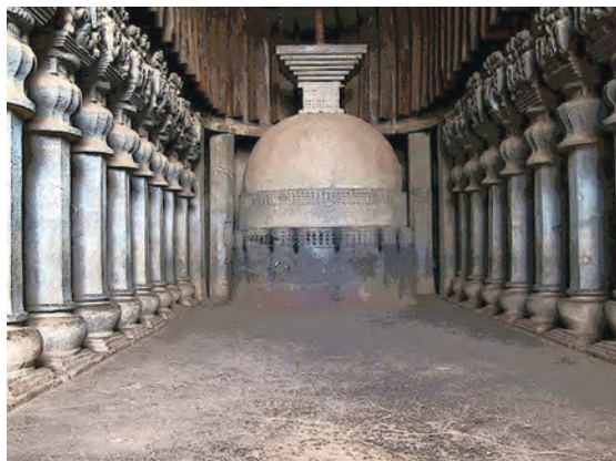
The Chaityagriha at Karla