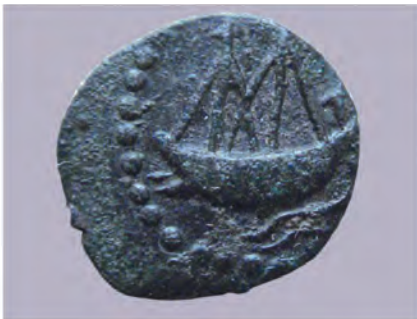
A Satvahana coin with a ship's image

images of ships. The cave sculptures at Ajanta, Nashik, Karla, Bhaje, Kanheri, Junnar in Maharashtra were carved