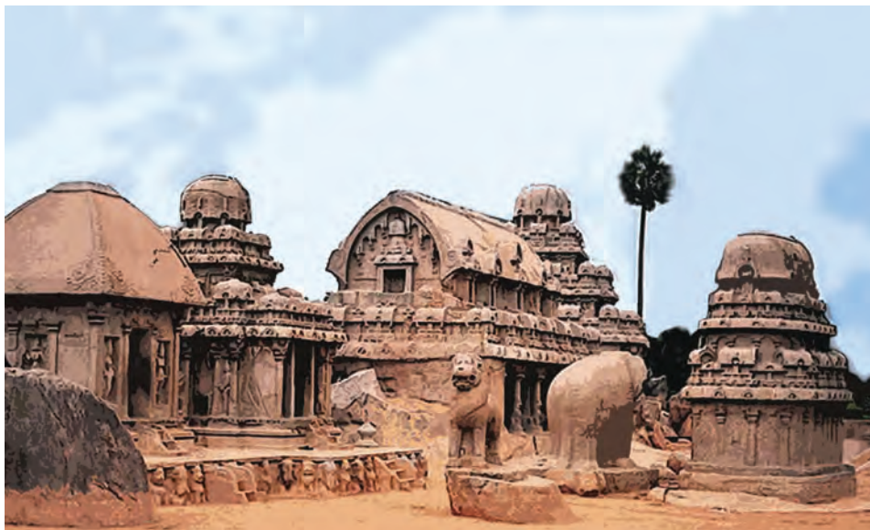
The ratha or chariot temples at Mahabalipuram

The Pallavas were also a powerful dynasty in South India. Kanchipuram in