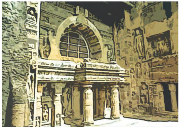
A cave at Ajanta

have read that the Gupta Emperor Chandragupta II had married his daughter Prabhavati to Rudrasen II, the Vakataka king. Varahdev, a minister of the Vakataka king Harishen, was a follower of Buddhism. Cave number 16 at Ajanta was dug at his instance. Some other