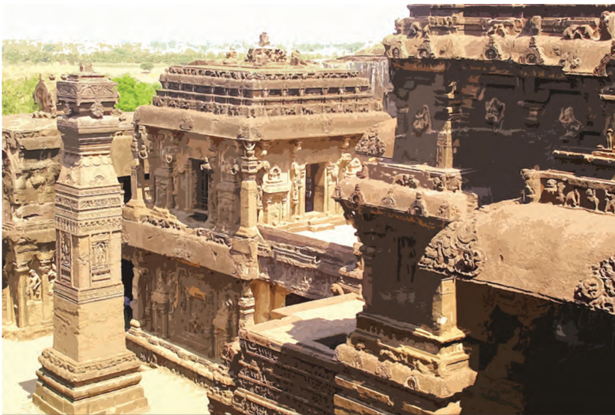
The Kailas Temple at Ellora (Verul)

Up to now, we have learnt about the different dynasties that ruled ancient India. In the next lesson, we will review the social and cultural life in ancient India.