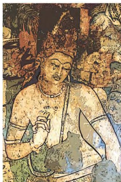
Bodhisattva Padmapani - Ajanta

caves at Ajanta were dug and beautified with paintings during Harishena's reign. The Vakataka king, Pravarsen II, composed 'Setubandh' in Maharashtra, a Prakrit language. Similarly, Kalidasa's 'Meghadoot' also belongs to this period.