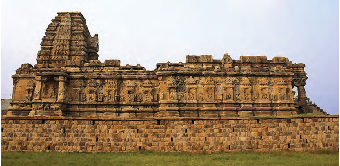
The temple at Pattadakal

the Chalukya dynasty in the sixth century CE. His capital was Badami which was earlier called 'Vatapi'. The Chalukya King Pulakeshi II had successfully repulsed Emperor Harshavardhan's invasion. The famous temples at Badami, Aihole and Pattadakal were built during the Chalukya period.