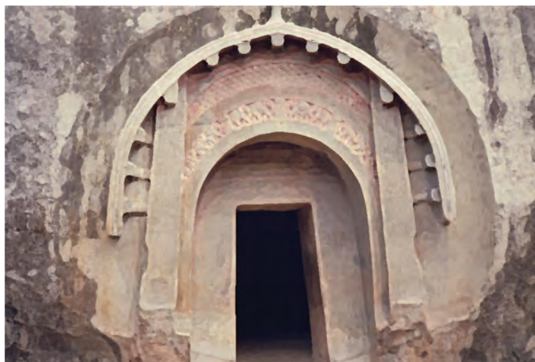
A cave at Barabar

Art and Literature : During the period of Emperor Ashoka, the art of rock cut sculpture was promoted. The pillars erected by Ashoka are excellent specimens of Indian sculpture. There are excellent carvings of animals like the lion, elephant, bull on these pillars. The chakra or wheel on the Ashoka pillar at Sarnath has a place