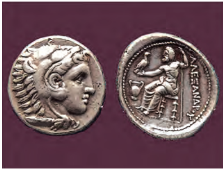
Alexander's silver coin - both sides

Later, Indian kings also started minting similar coins.