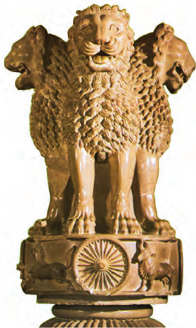
The Lion Capital

Different festivals and functions were celebrated in villages and towns. Dance