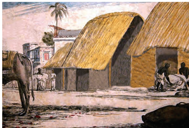
Houses in the Vedic period

be found in the Vedic literature. Yava means 'barley', godhoom - wheat, vrihi - rice. The