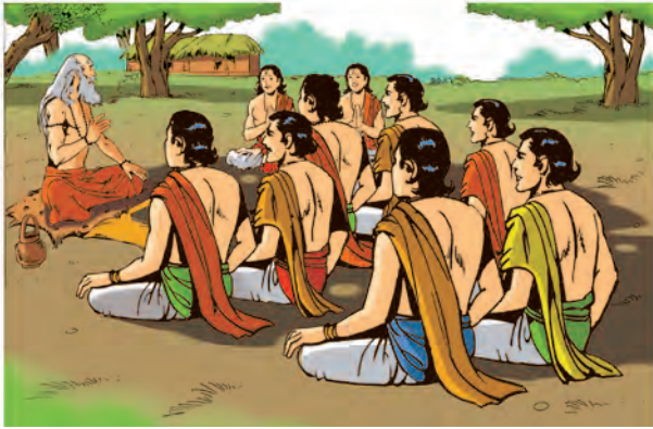
Guru and disciples

expected to detach himself from the household, retire to a solitary place and lead a very simple life. The fourth stage was the sanyasashrama . At this stage, the convention was to renounce all relations, lead life in order to understand the meaning of human life, and not stay in one place.