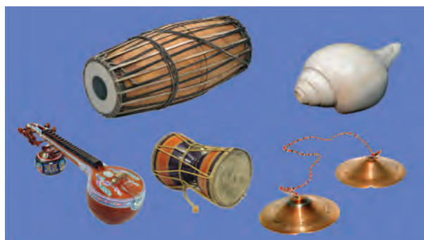
Vedic musical instruments

Singing, playing musical instruments, dance, board games, chariot-race and hunting were the means of recreation. Their main musical instruments were veena , shat-tantu , cymbals and the conch. Percussion instruments like damru and mridanga were also used.