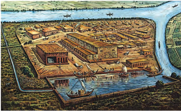
An artist's visualization of the dockyard at Lothal (Reconstructed with the help of the remains)