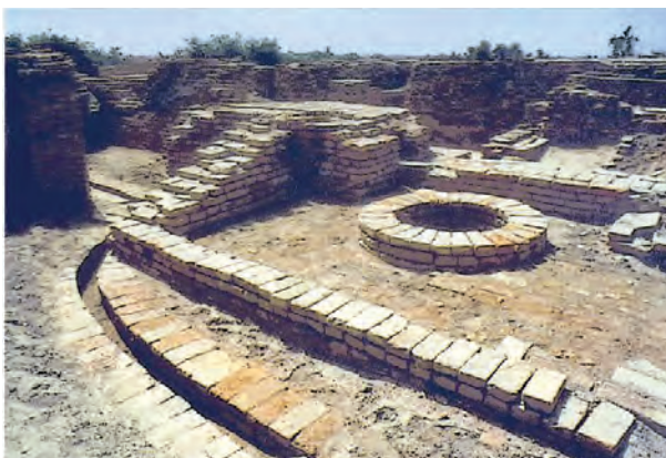
Harappan Civilization well

The streets were broad and laid out in a grid pattern. Houses were built in the rectangular blocks created by them.