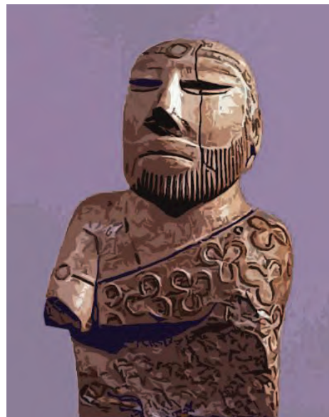
A specimen of Harappan art

A statue found at a Harappan site presents an excellent specimen of their art. It shows the man's facial features very clearly. A cloak with a beautiful trefoil pattern is draped across his shoulder.