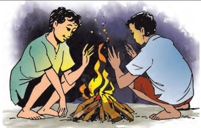
Figure 4.1 : Boys warming themselves.

Mussoorie is located to the north of the Tropic of Cancer, hence it receives less solar heat. The air there is cool too due to its location on a mountain. Clothes take longer to dry here because of the medium heat and cool air. Factors like heat, moisture, and wind influence the time taken by the clothes to dry. However, these conditions keep on changing. We always experience such changes.