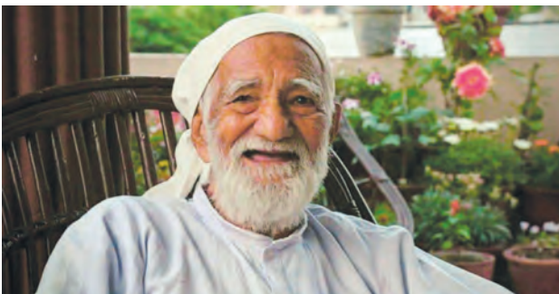
Environmentalist - Sunderlal Bahuguna

However, demographic and economic factors led to indiscriminate use of forests and led to deforestation. Processes of industrialisation and development led to improvement in the means of transport and communication. People involved in developmental projects challenged the established claim of local people on forests. Loss of means of livelihood affected and angered people leading to the emergence of the movement. In April 1973, when the contractors along with the workers reached Mandal village to cut trees and to clear jungles spaces allotted to them by the State government, the inhabitants hugged the trees, to resist and to mark their protest. The action happened at a mass level, as a result of which the authorities had to retreat. The women of the village also participated in the protest. This incident boosted the morale of several other groups facing similar problems to get together and to protest against deforestation.