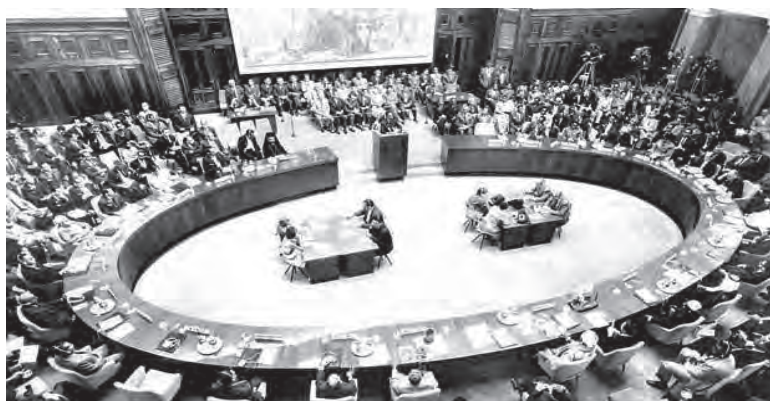
First Nonaligned Summit Meeting, Belgrade, 1961

Nonalignment has been an important feature of India's foreign policy. Non-alignment literally means not to be a part of any military alliance. It was India's response to the Cold War politics of the two super powers. The United States and the Soviet Union attempted to extend their respective 'sphere of influence' through promoting military alliances in Europe, Asia and elsewhere in the world.