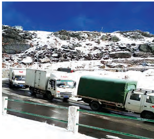
India China Border Trade, Nathu La

Relations between China and India in the twenty-first century are quite complex in nature. On the one hand, the border dispute between the two countries has not been resolved and continues to create tensions. On the other hand, the two have opened the Nathu La in Sikkim for cross-border trade. Trade relations between the two countries