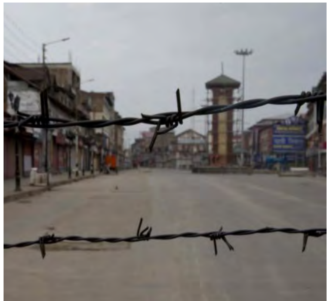
Lal Chowk, Srinagar : Two different images