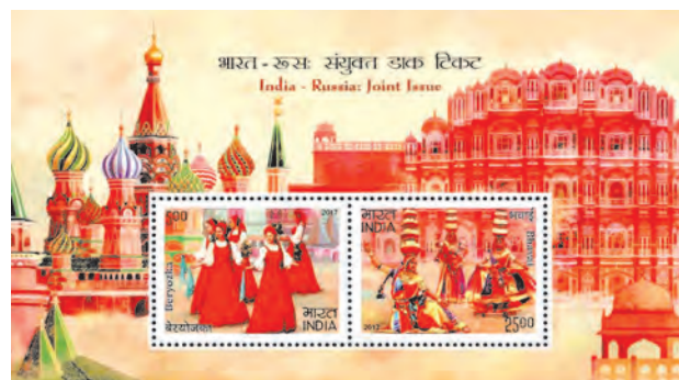
Joint issue of postage stamp between India-Russia

aid in the form of technology and low-interest credit to India's heavy industry projects in the public sector. It also provided major weapons to the Indian defence forces and made agreements for licensed-production of some of these weapons in India. Indo-Soviet Friendship Treaty of 1971 was an important milestone in the bilateral relations.