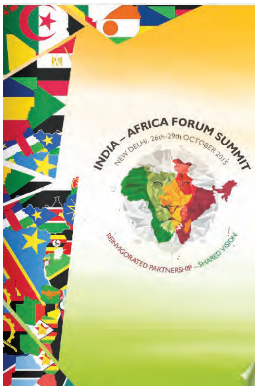
India Africa Summit, New Delhi, 2015