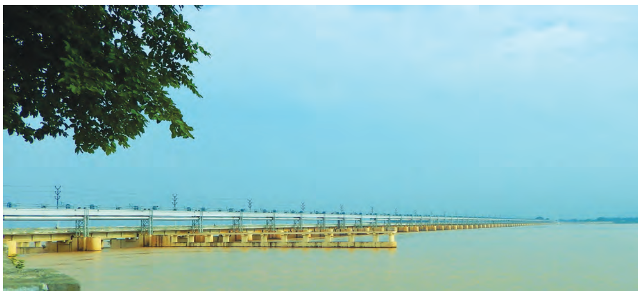
Farakka Barrage: Agreement on sharing of Ganges waters at Farakka was signed between India and Bangladesh in 1996.

Relations with Sri Lanka have experienced both good and bad phases. The two countries had a disputed maritime boundary and a related problem of fishermen of both sides crossing into the territory of the other and being captured by the coastal forces. Similarly, the Tamil question in Sri Lanka has often proved to be an irritant for the relations. Sri Lanka had accused India of supporting the