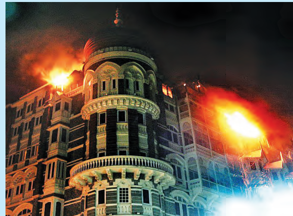
Terrorist attacks, Mumbai : July 2006 and November 2008