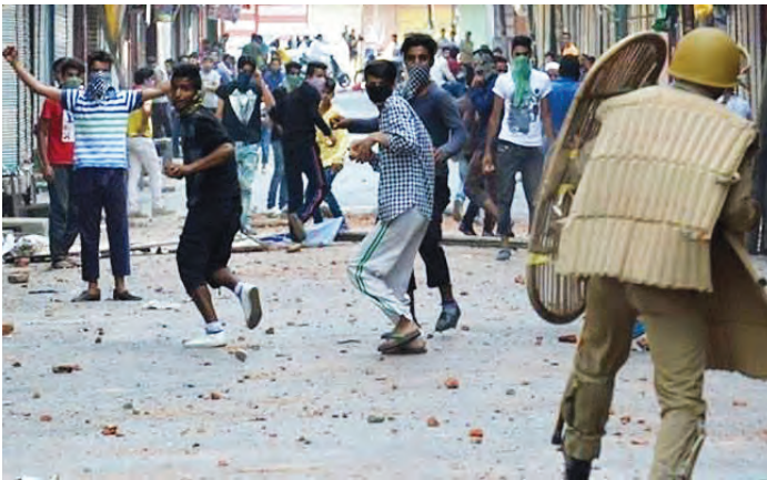
Stone Throwing in Kashmir