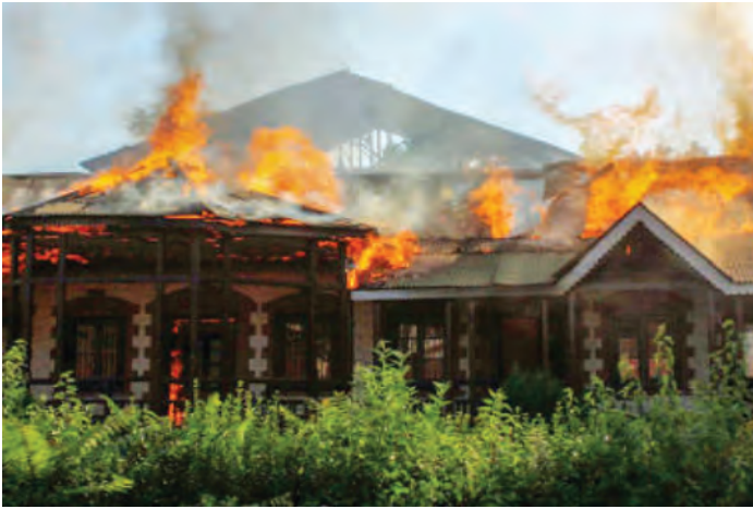
Burning of Schools : Kashmir