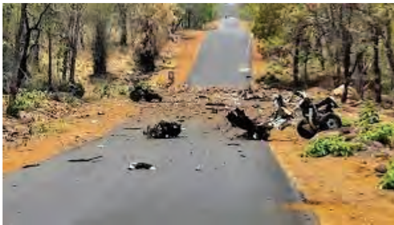
Naxal attacks, Gadchiroli

In 2004, the People's War (PW), then operating in Andhra Pradesh, and the Maoist Communist Centre of India (MCCI), then operating in Bihar and adjoining areas, merged to form the CPI (Maoist) Party. The CPI (Maoist) Party, is the major Left-Wing Extremist outfit that has been included in the Schedule of Terrorist Organisations along with all its formations and front organisations under the Unlawful Activities (Prevention) Act, 1967. The CPI (Maoist) philosophy is to use armed insurgency to overthrow the Government.