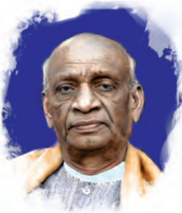
Sardar Vallabhbhai Patel

When India gained independence, there were more than 600 princely states of various size. Their political integration was the biggest challenge faced by the leaders of independent India. There