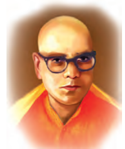
Swami Ramanand Tirtha

Hyderabad Freedom Struggle : Hyderabad was the largest amongst the princely states in India. It comprised Telugu, Kannada and Marathi regional sections. It was ruled by Nizam. He put restrictions on the civil and political rights of his subjects to a great extent. To fight against the suppressive policies of Nizam people of the state established various organisations, namely, ‘Andhra Parishad’ in Telangana, ‘Maharashtra Parishad’ in Marathawada and ‘Karnataka Parishad’ in Karnataka. Swami Ramanand Tirtha led Hyderabad freedom struggle skillfully with the help of loyal workers of these three organisations. He founded the ‘Hyderabad State Congress’ and gave a momentum to the struggle for Hyderabad’s accession.