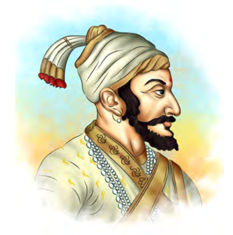
Chhatrapati Shivaji Maharaj

*The northern region of Goa was known as 'Bardesh'.