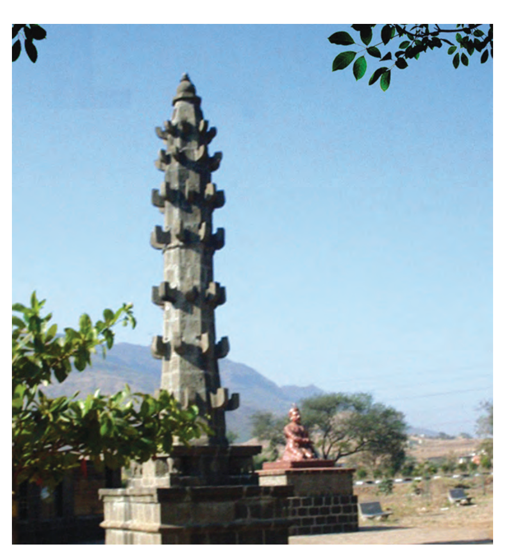
The Memorial of the First Anglo-Maratha war - Vadgaon Mawal