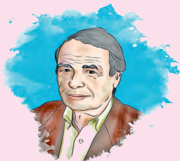
Figure 2: Pierre Bourdieu (1930-2002)

(1) Wealth and Income: Possession of substantial amounts of wealth is the main characteristic distinguishing the upper class from other class groups in society. Persons having more wealth and income generally have higher social position and respect in society. Though,