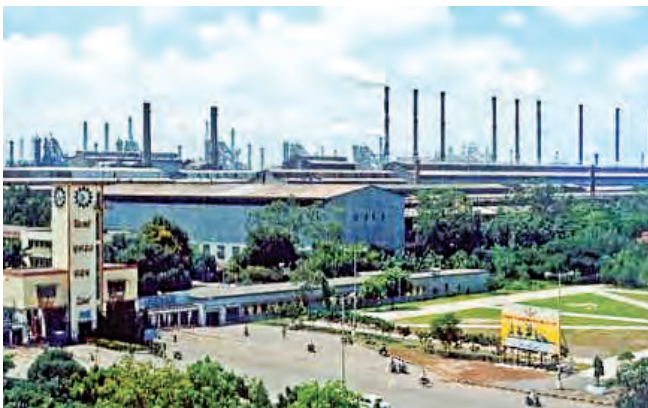
Bhilai Steel Plant

(ii) Output-oriented: Development Administration aims to achieve certain outcomes and results for which it sets out clear-cut norms of performance. These are usually quantitative norms. If change