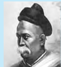
Justice Mahadev Govind Ranade

Focused on elimination of gender and caste discrimination.