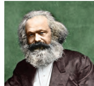
Karl Marx (1818-1883) A German Philosopher

Karl Marx considers the State as an instrument of exploitation of workers. This