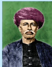
Mahatma Jyotirao Phule