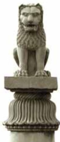
Capital of an Ashokan Pillar

There was a huge palace of Chandragupta at Pataliputra. Megasthenes compares it with the Palace of Susa, the capital of Iran. The high brick fortification wall was built for the protection of the palace and inside the palace there were many buildings. These buildings were built of stone. Wood was also used in the buildings. The Chinese traveller Fa-hien has described this palace. One of the unique contribution in the field of art are the huge standing pillars erected during the period of Ashoka for the spread of religion. We know them as Ashokan Pillars. These pillars are erected at thirty places. They are erected at places related to important events in the life of Gautama Buddha and on important royal paths. During Ashoka's period, stupas were built on a large scale. It is said that during his rule, Ashoka built 84,000 stupas.