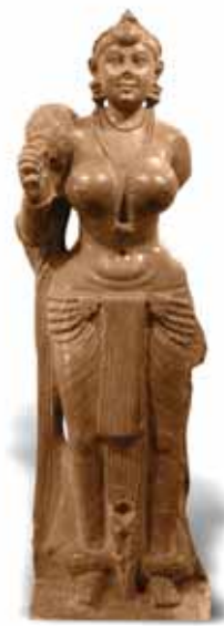
Chauri bearer of Didarganj

It appears that, during the Mauryan period, the artists had acquired the skill of cutting and carving the stone. In both, the skill of sculpting and the technique of mirror polish of the stone is seen. This is known as 'Mauryan Polish'. During this period stone statues of Yaksha and Yakshi are found.