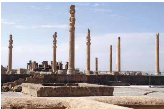
Columns at Persepolis

Susa and Persepolis. For that purpose, emperor Cyrus got Greek architects and sculptors from the Greek settlements in Asia minor under his rule.