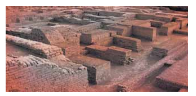
A multi-roomed house at Mohenjodaro

The remains at Mohenjodaro were considerably intact. So the glory of the city was revealed in way of the houses, majestic buildings, wide streets, etc. Thus the evidence of the impressive town planning, and public administration, characteristic of the Harappan civilisation came into light. The town planning of the Harappan cities can be easily compared with the town planning of a modern city like