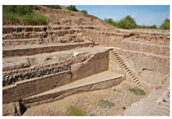
The Water Tank at Dholavira