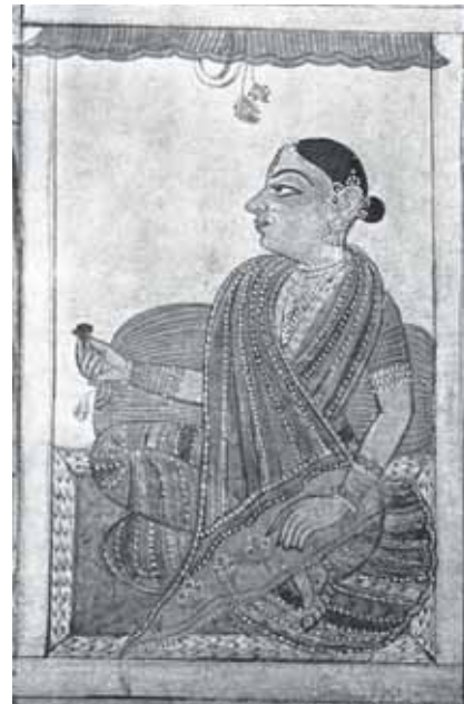
Miniature painting - Maratha period

Bajirao I, Nanasaheb Peshwa, Pilaji Jadhavrao are available. Murals are found on the facade of the Wadas, as well as on the walls of reception areas (Diwankhana) and bedrooms. In the temples, the mandapa wall, owri (varanda), shikhara, gabhara ( sanctum sanctorum ) and chhat (ceiling) were also decorated with paintings. The 18 th century murals have survived till today at places like the Naik-Nimbalkar wada at Vathar, Nana Phadanavis wada at Menavali, Rangamahhal at Chandwad, Mayureshwar mandir at Morgaon, Shiva temple of Pandeshwar, and Matha at Benawadi. Mythological stories form the main theme of these murals. They include scenes from Ramayana and Mahabharata and Puranas. The paintings of Dashavatara and Krishnaleela are found almost everywhere. The subjects of contemporary social life were also popular in the paintings. Royal court, royal meetings, processions were also included in them.