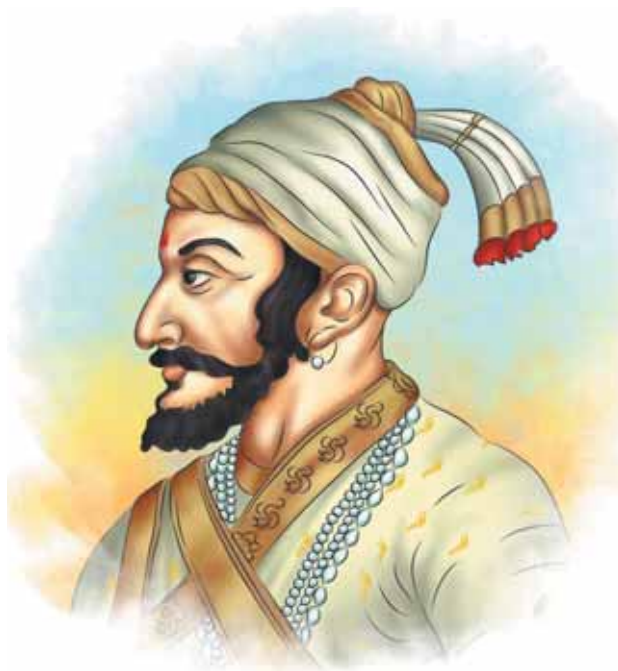
Chhatrapati Shivaji Maharaj

For Additional Information : The Mawal region is a mountaineous terrain and is not easily accessible. The vallyes at the foot of Sahyadri ranges in Maharashtra are known as 'Mawal' and the local people of Mawal are known as 'Mawalas'. The Mawalas in the army of Shivajiraje played a great role in establishing Swarajya. Shivaji Maharaj had created a feeling of trust and affection in their minds. Shivaji Maharaj set himself on the task of establishing Swarajya with the support of these Mawalas. Many of his close associates like Kanhoji Jedhe, Tanaji Malusare, Netoji Palkar, Baji Pasalkar, Baji Prabhu Deshpande, Murarbaji Deshpande etc. were from the Mawal region.