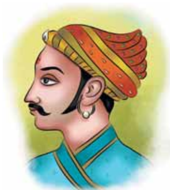
Chhatrapati Shahu Maharaj

The Mughals continued their efforts to defeat the Marathas, even after the death of Aurangzeb. For that purpose they adopted the strategy of dividing the Marathas. They released Shahu Maharaj from captivity in 1707 C.E. After his release there was a conflict between Maharani Tarabai and