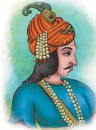
Bajirao Peshwa I

lowered the morale of the Marathas greatly.