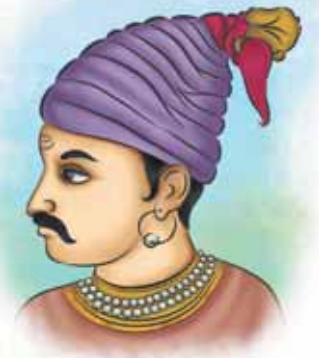
Chhatrapati Rajaram Maharaj

This was an indication that the scenario of the war was changing. The Maratha War of Independence was a tussle between the Mughal ambition of expanding their Empire and the desire of independence cherished by the Marathas. Finally the death of Aurangzeb put an end to this fighting. In the beginning, the Mughal rulers adopted an