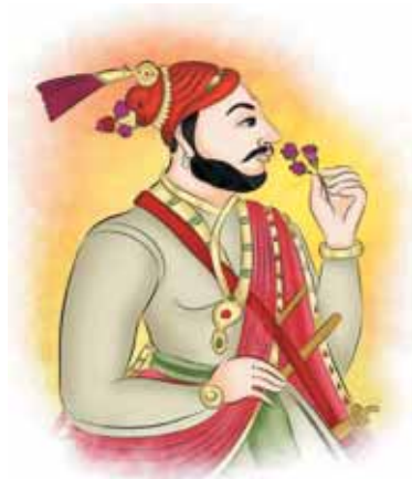
Chhatrapati Sambhaji Maharaj

After the death of Chhatrapati Shivaji Maharaj, Chhatrapati Sambhaji Maharaj was coronated as the king of Swarajya. During his reign, a constant conflict continued with the Mughal emperor Aurangzeb. Aurangzeb's rebellious son Akbar had established friendly relations with Sambhaji Maharaj. Enraged by