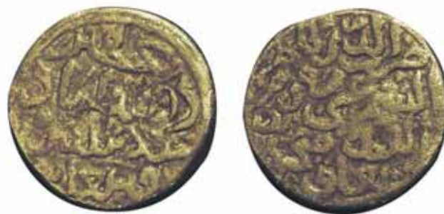
Coins of Muhammad-bin-Tughluq

During the Sultanate period there were major changes in coinage system. Instead of images of deities on the coins, the names of the Khalifa and the Sultan were inscribed on the coins. Details regarding the year of issue, place of minting etc. were inscribed on it in the Arabic script. 'Tola' came to be considered as a standard unit for the weight of the coin.