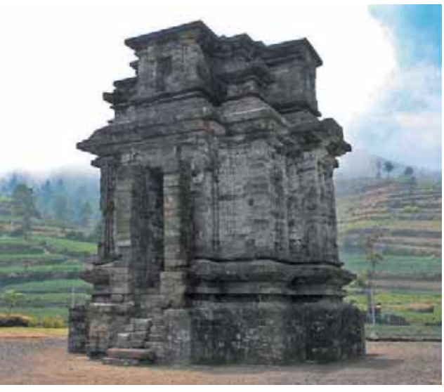
Dvaravati style of temple architecture

Thailand: The ancient Thai people referred to their country as 'Mueng Thai'. However, it was known in the world as 'Siam'. In the 20th century its name was changed to 'Thailand'. Thailand was ruled from the 6th to the 11th century by 'Mon' people. At that time it was known as 'Dvaravati'. Indian culture was introduced and spread in Thailand in the 'Dvaravati' period. The Indian traditions of sculpture, literature, ethics, judicial science, etc. had a great role in shaping up the Mon culture. Compared to other kingdoms in Southeast Asia the kingdom of Dvaravati was smaller and weaker. However, it contributed greatly development of writing, administration, religion and science, etc. in the other kingdoms. The remains of sculptures and architecture of the Dvaravati period have been found in the vicinity of the cities like Lop Buri (Lao Puri) and Ayuttha (Ayodhya).