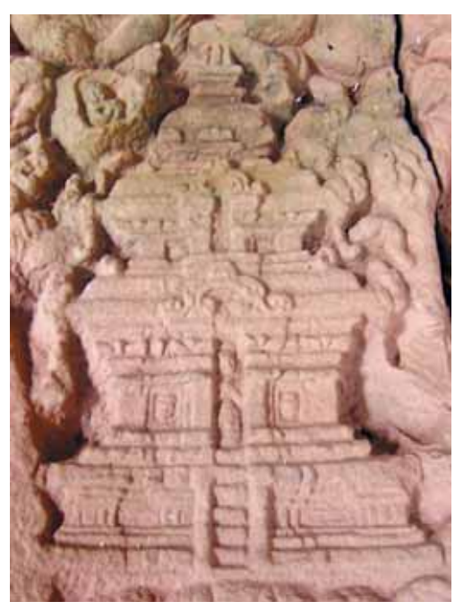
Sculptural model of My Son Temple

The characteristic aspect of the architectural style of My Son temples is that it is imagined in the form of 'Meru Parvata'.