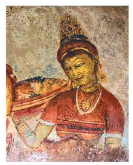
Mural of Sigiriya

There is an enormous rock in the mountains near the city of Dambulla. A fort and a palace was built on this rock. At its entrance a huge image of a lion was carved in the rock. The place was named 'Sigiriya' after this lion. Sigiriya murals are compared with the murals at Ajanta.