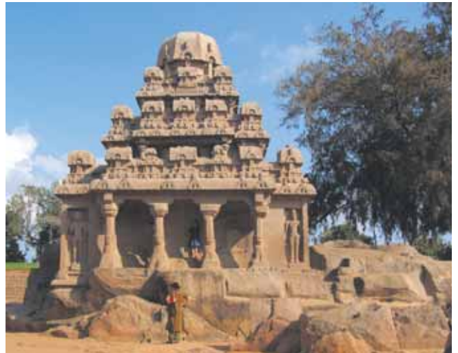
Yudhisthira Rath Temple at Mahabalipuram

were built at Tiruchirapalli, Chingalput and in east and west Arkat district. The war between Pallavas and Chalukyas took place during his period. His son Narsimhavarman defeated the Chalukyan Emperor Pulakeshi II. During Narsimhavarman's region, many temples were built at Mahabalipuram. It includes the monolithic temples (Rath Mandiras) as well. Yuan Chwang, the well-known Chinese traveller, was in his court for a certain period of time. The literary works by Narsimharvarman are important as major source of Pallava history. The Pallava rule ended in 9 th century C.E. The Chola king, Aditya, defeated the Pallavas and destroyed it.