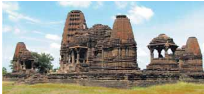
Gondeshwar Temple at Sinnar

'Lilacharitra' written by Mhamimbhatta of the Mahanubhava sect, 'Viveksindhu' by Mukundaraj, 'Bhavarthdipika' Dnyaneshwari by sant Dnyaneshwar belong to this period. Similarly the composition of saint poets like Namadeva, Janabai, Chokhoba of the Varakari sect composed poems, which are known as 'Abhangas'. Many temples were built in this period. They are generally referred to as 'Hemadpanti' temples. The Gondeshwar temple at Sinnar and the temple complex at Anjaneri are the finest example among the temples built during this period. An important feature of the Hemadpanti temples is that no mortar is used. Instead the stones are interlocked with the help of mortise and tenon. During this period, the crucial forts of Ankai and Tankai Near Nasik were constructed.