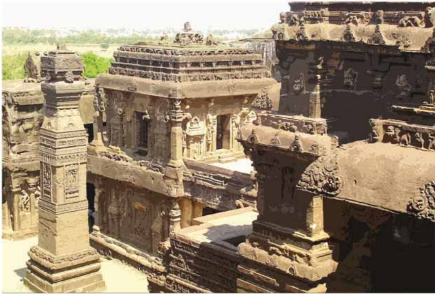
Kailash Temple at Ellora

Shilaharas : There were three branches of this dynasty – Shilaharas of south Konkan, north Konkan and Kolhapur. They called themselves as ‘Tagarapuradhiswar’ (Tagar-Ter, Osmanabad district). Jimutvahan is considered as the founder of all the three branches. They ruled for almost three hundred years as the feudatories of Rashtrakutas and later the Chalukyas.