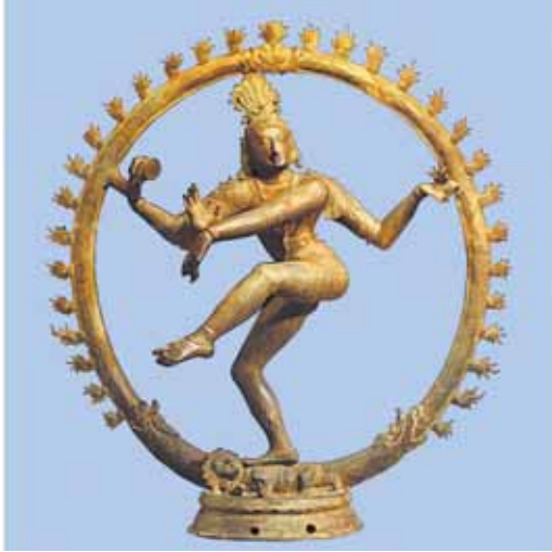
Bronze statue of Nataraj Shiva

are the best among Indian metal sculptures. Among them the most famous is the bronze statue of Nataraj Shiva.