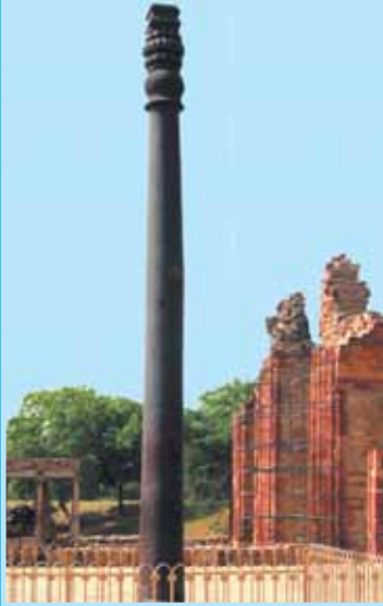
Iron Pillar : Mehrauli

You would like to know : In the Gupta period, there was remarkable progress in making alloys and casting of metals. The