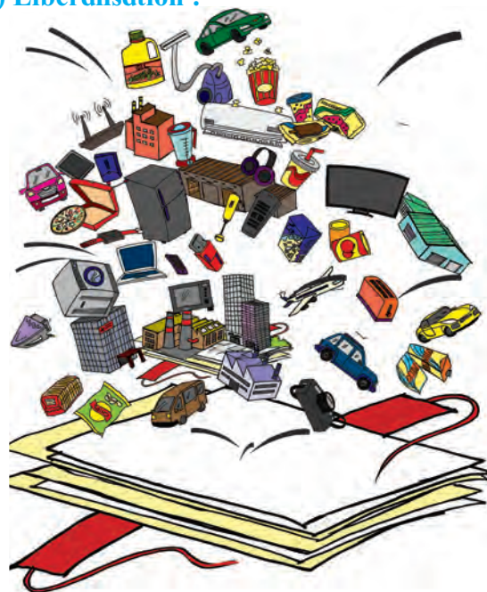
Fig. 9.1 : Liberalisation

Meaning : Liberalisation refers to 'economic freedom' or 'freedom for economic decision'. It means producers, consumers and owners of factors of production, are free to take decision to promote their self interest. Adam Smith in his book, 'Wealth of Nations' suggested that economic liberalisation is the best economic policy to promote economic growth and well being of the people.