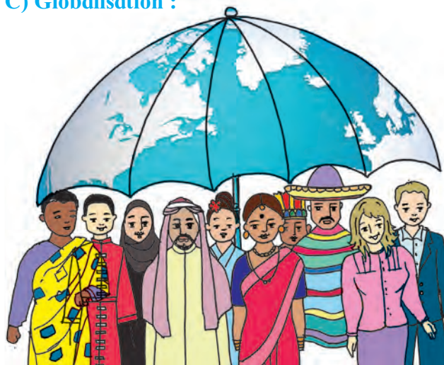
Fig. 9.3 : Globalisation