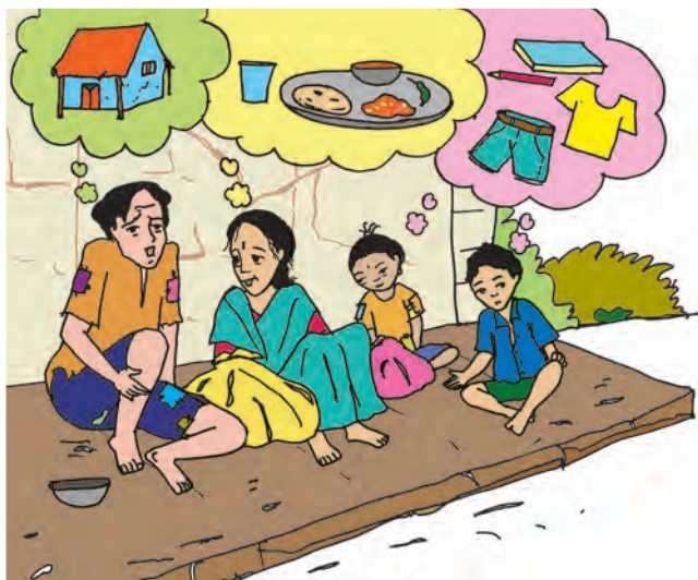
Fig. 8.1 : Poverty