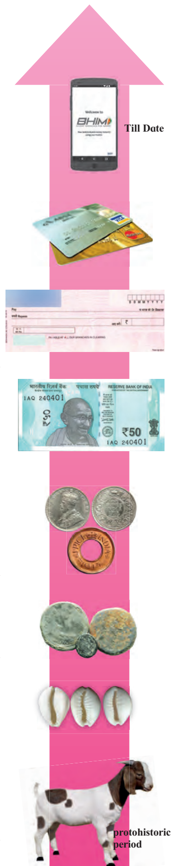
Fig. 2.2 : Evolution of Money