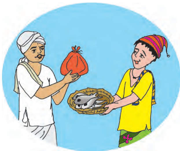
Fig. 2.1 : Barter system

Man is an intellectual animal. The invention of money is one of the important and fundamental inventions out of various inventions in the world. According to Crowther, there is a basic invention in each branch of knowledge, e.g. invention of fire in science, invention of wheels in mechanical science. The concept of money is an important concept which has brought about a revolutionary change in the economic life of human beings. Various goods and services are bought and sold with the help of money, to satisfy human wants. Modern economy is dependent on money. Money which is in circulation today was created to reduce the difficulties in Barter System.